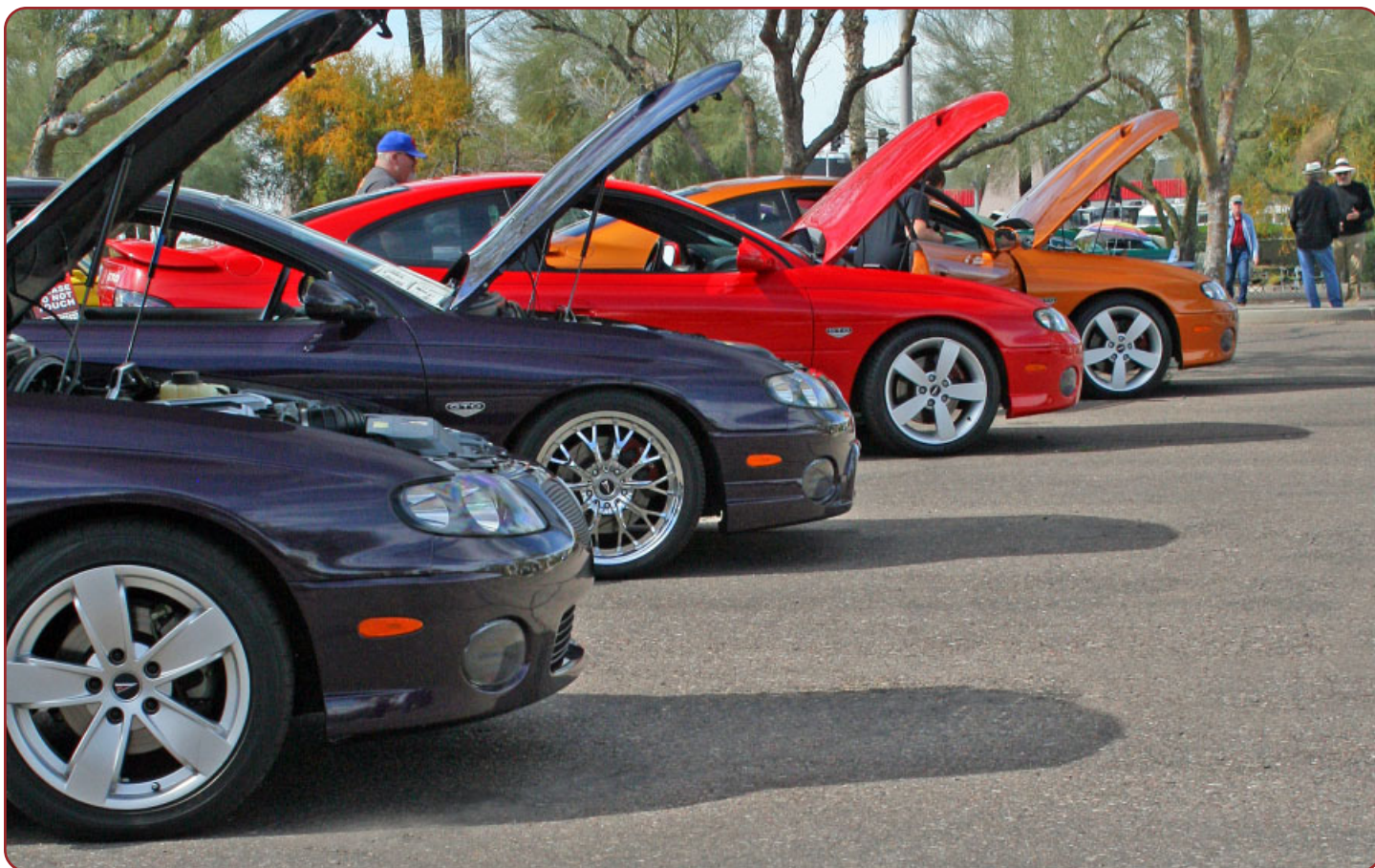
From Left: New-Gen GTOs on display included this pair of Cosmos Purple 2004s and a Torrid Red and a Brazen Orange 2006.