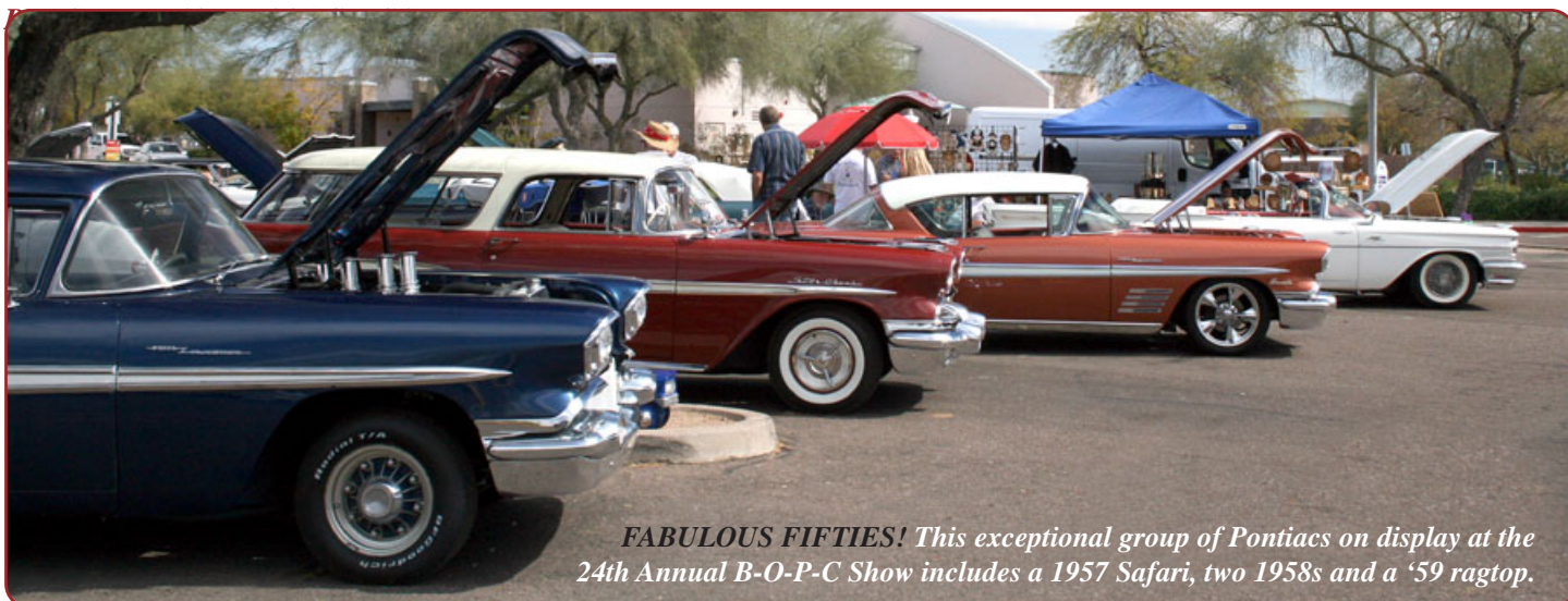
FABULOUS FIFTIES! This exceptional group of Pontiacs on display at the 24th Annual B-O-P-C Show includes a 1957 Safari, two 1958s and a '59 ragtop.